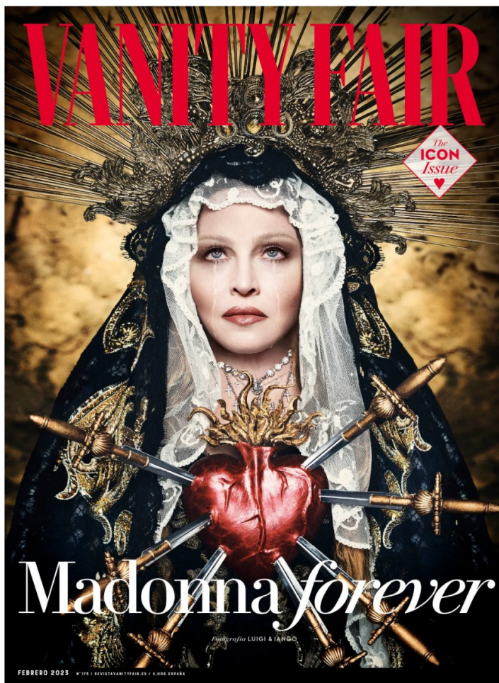
Vanity Fair Spain

Incidentally, the artist's announcement of "The Celebration Tour" on Instagram came with dedicated posts and a video showing her playing truth-or-dare with other celebrities, including Amy Schumer. "Madonna, I dare you to do a world tour and play the greatest motherf—ing hits," says Schumer in the video, before the singer accepts the challenge.